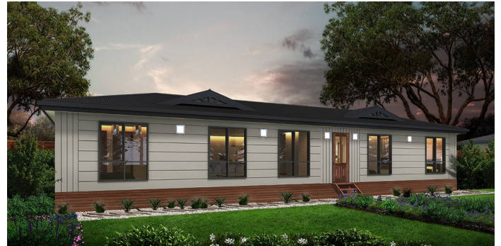
Facades displayed above are for illustrative purposes only and some items may not be included in the price

A spacious family area is ideally located at the heart of this beautiful home, providing a sophisticated and relaxing atmosphere. Entertain friends or simply relax on warm summer nights in the Rosemont.