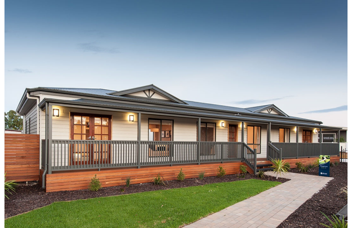
Facades displayed above are for illustrative purposes only and some items may not be included in the price

A spacious family area is ideally located at the heart of this beautiful home, providing a sophisticated and relaxing atmosphere. Entertain friends or simply relax on warm summer nights in the Rosemont.