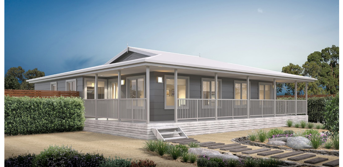
Facades displayed above are for illustrative purposes only and some items may not be included in the price

The style that the Lucindale displays in its facade is continued throughout the interior of the home. The spacious living and family area with the large front verandah creates a home that is perfect for the entertainer.