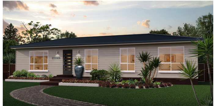
Facades displayed above are for illustrative purposes only and some items may not be included in the price

Simple yet appealing, the Mulford is functional and well thought out. Sunlight floods the bedrooms and large living area along the front of the home, creating a feeling of warmth and space.