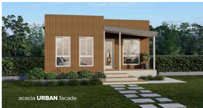
acacia URBAN facade

With three spacious bedrooms and ample living space, the Acacia lends itself to executive style park living. Perfect for a manager's residence, or larger groups of friends and family, this comfortable, open plan design provides a generous entertaining setting. The second living space could feature as a Kids Retreat whilst the family and meals areas flow out onto the covered rear deck, providing ample room to make the most of the Australian way of life.