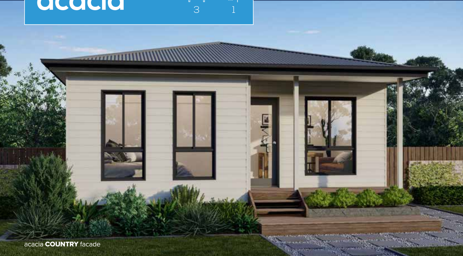
acacia COUNTRY facade