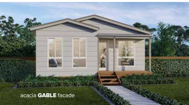
acacia GABLE facade