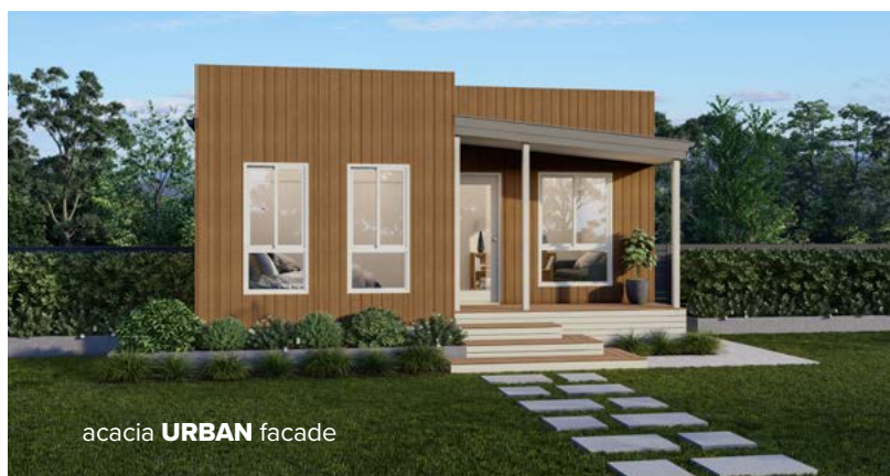
acacia URBAN facade

With three spacious bedrooms and ample living space, the Acacia lends itself to executive style park living. Perfect for a manager's residence, or larger groups of friends and family, this comfortable, open plan design provides a generous entertaining setting. The second living space could feature as a Kids Retreat whilst the family and meals areas flow out onto the covered rear deck, providing ample room to make the most of the Australian way of life.