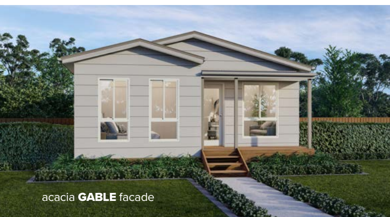
acacia GABLE facade