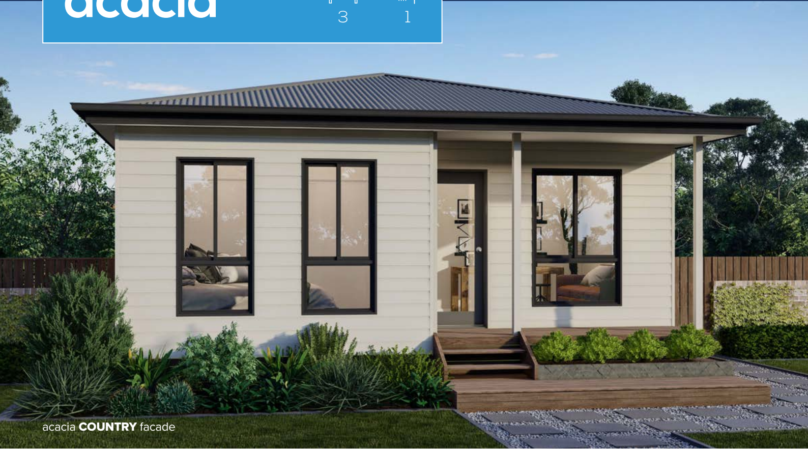
acacia COUNTRY facade