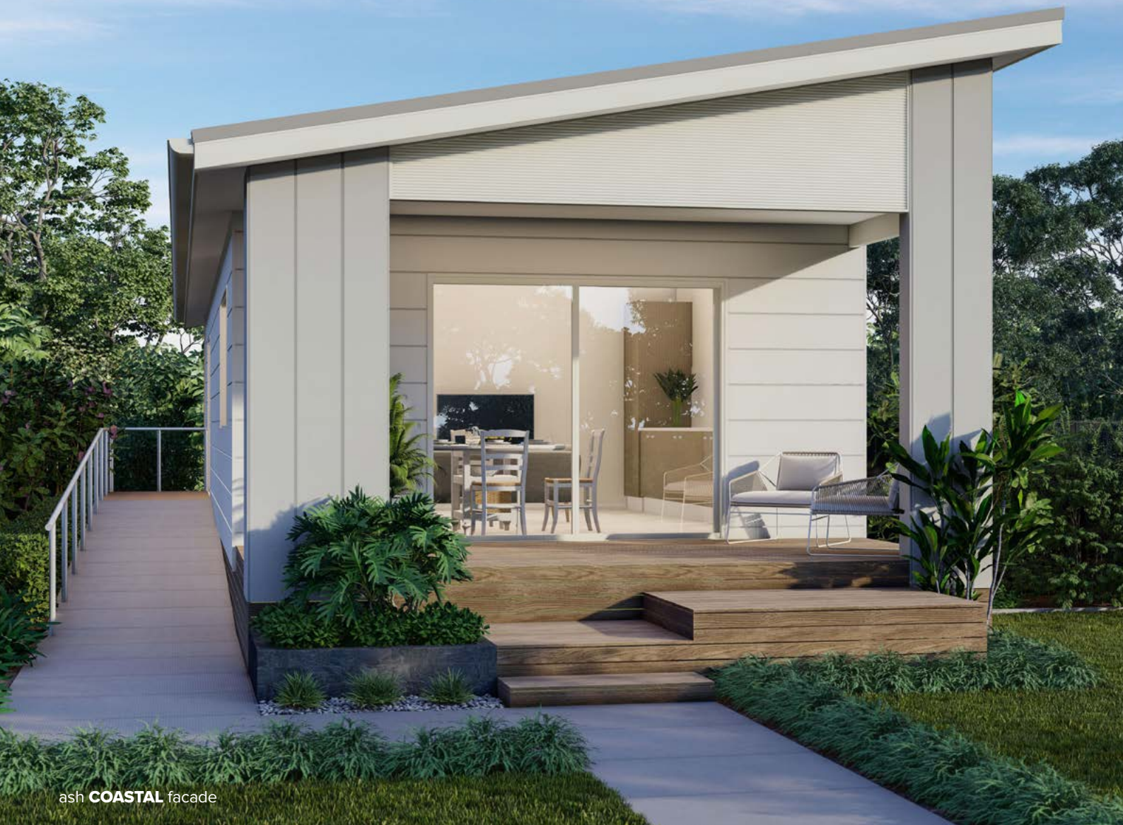
ash COASTAL facade

Our stylish, well-appointed Ash home has been specifically designed for independent living. With ramp access to the home, this design has all the requirements to suit people with limited mobility, whilst creating a stylish and fully accessible space. This home provides generous and comfortable living spaces and is equipped with various accessible and mobility impaired facilities and fittings for guests. The Ash design incorporates a highly functional minimalist layout to provide added comfort without any limitations on accessibility.