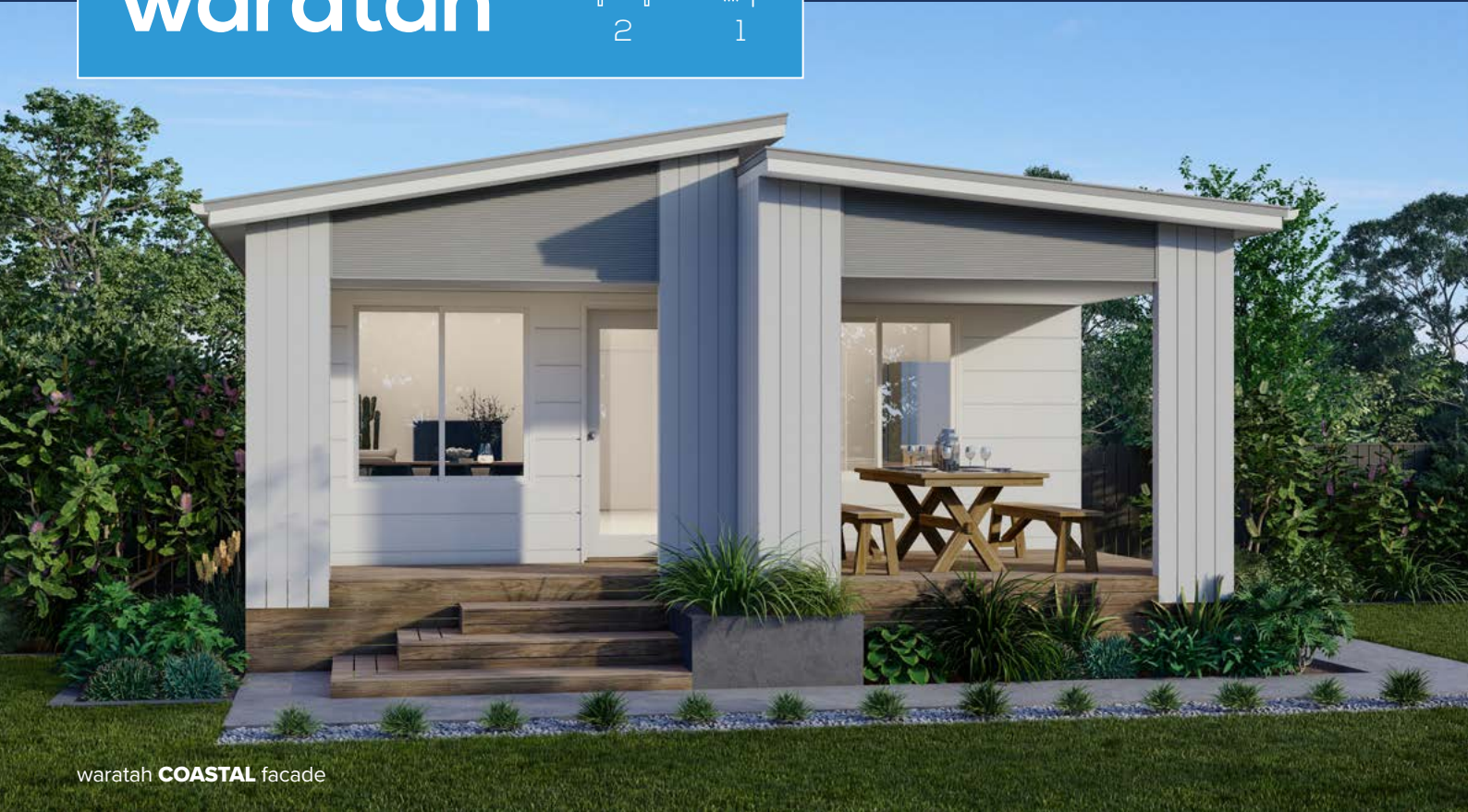
waratah COASTAL facade