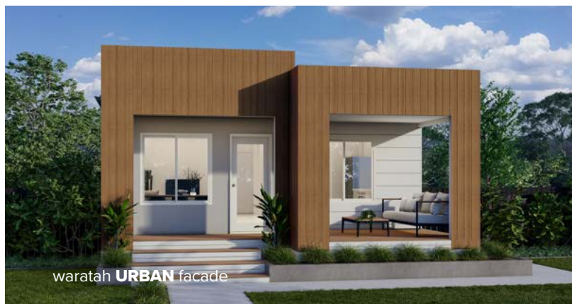
waratah URBAN facade

The Waratah home design is perfectly suited to a coastal or country landscape, plus everything in between. The large window frontage serves as a great vantage point to take in the views or soak up the sunshine from the deck. There is generous open plan living, dining and kitchen space perfect for entertaining.