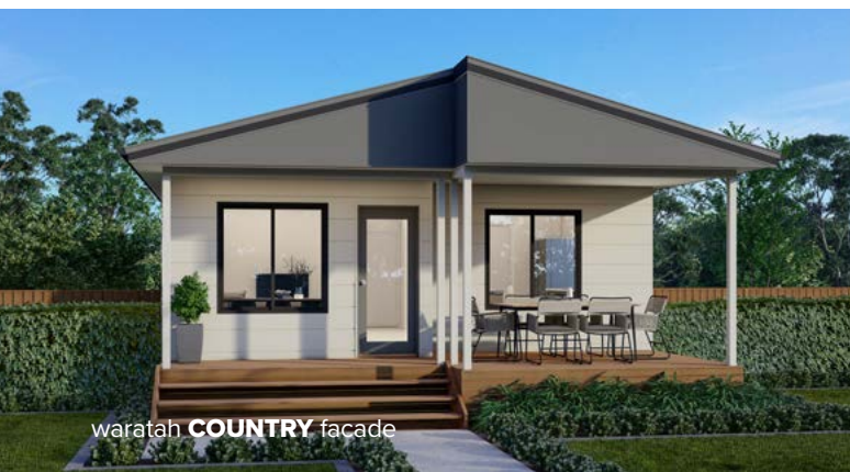
waratah COUNTRY facade