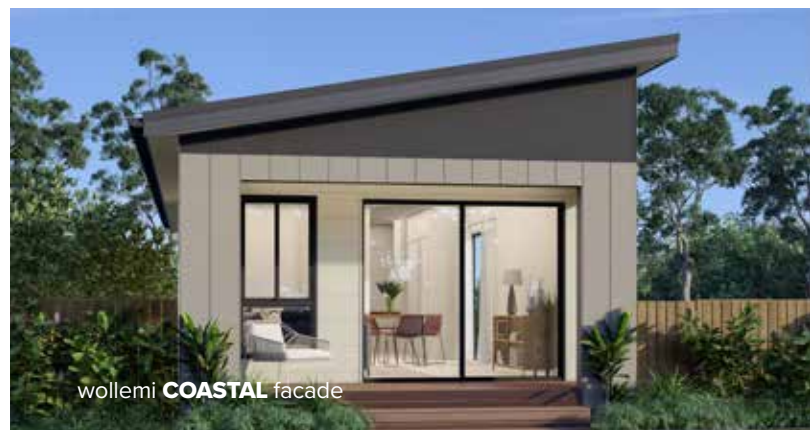
wollemi COASTAL facade

The Wollemi's functional flow and streamline footprint ensures this home caters to everyone's needs. This home welcomes open plan living as you enter the front door. Quality Fisher & Paykel kitchen appliances make your modest family meals a dream to create. The 2 bed – 1 bath layout suitably meets the needs of young families with maximum practicality. For those who love their space, or the chance to entertain on holidays this home away from home provides ample comfort with everything you need to enjoy.