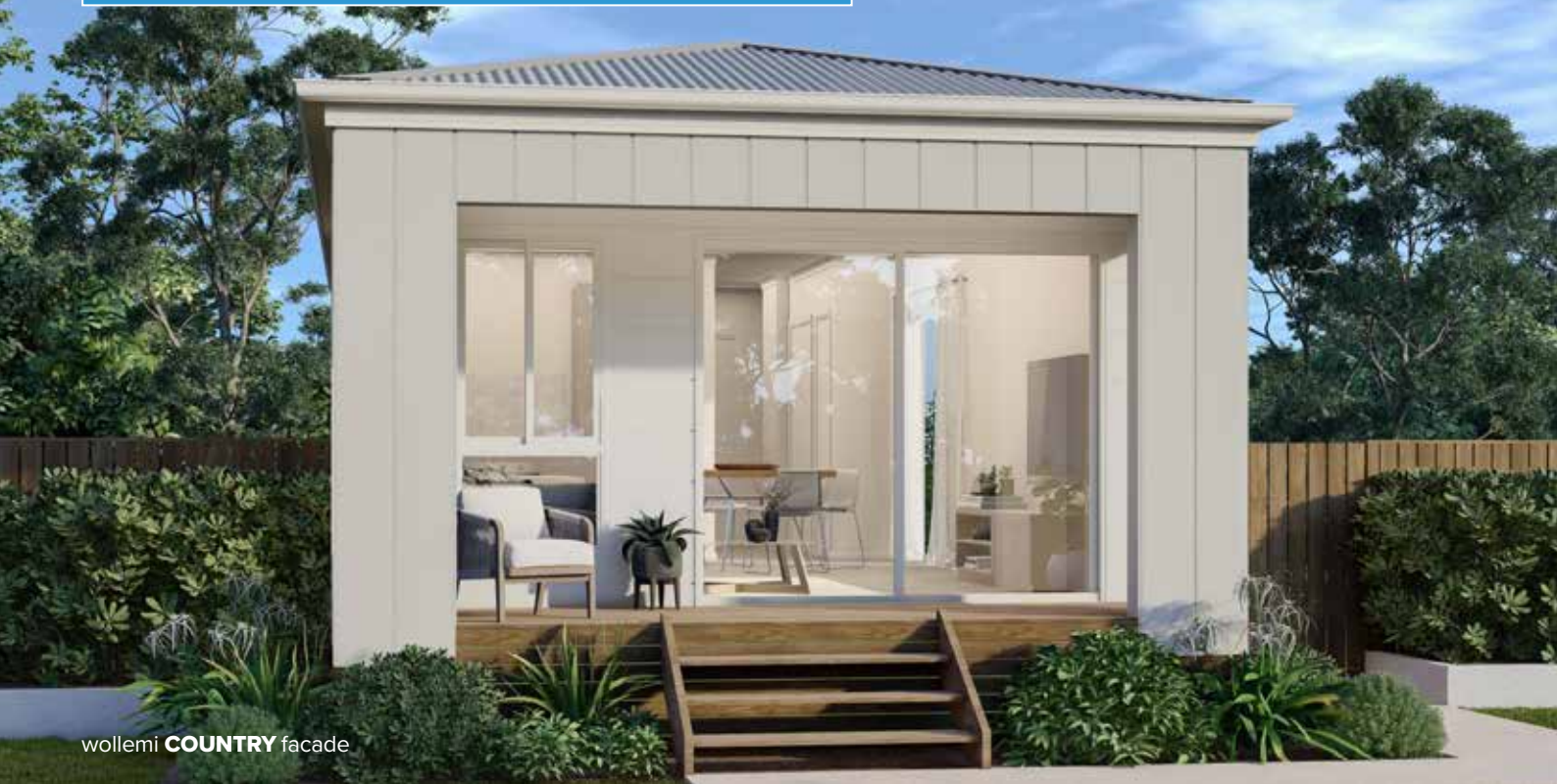
wollemi COUNTRY facade