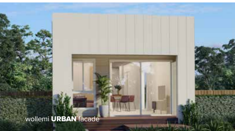
wollemi URBAN facade